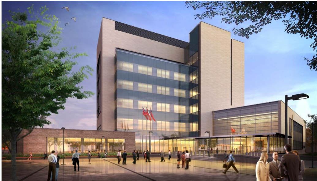
Brookfield Infrastructure Partnerships Quinte